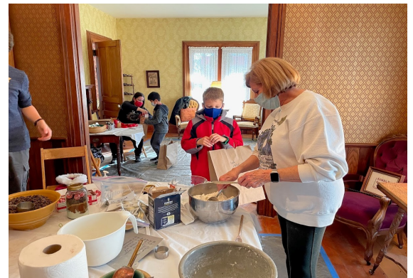
Cooking in the Yerkes (above) and crafting in the Hunter (below)