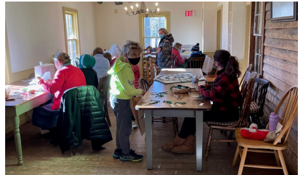
Busy in the Cady Inn