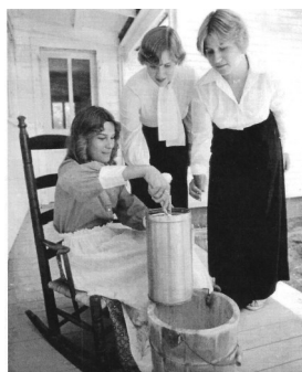
Junior Docents making ice cream on the Yerkes porch.