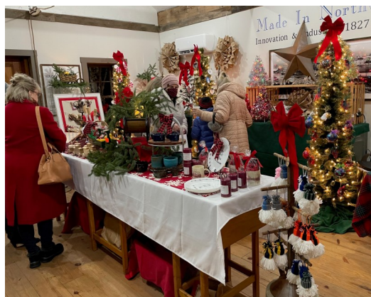
Revelers took time out to do a little shopping in the Hirsch Museum converted for the occasion.