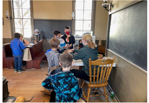
Ornament-making in the School House

The only downside to the event was not having all the kids working in one building making noise, adding to the busy chaos, and emulating the industrious elves in Santa's workshop.