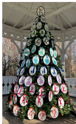
Placed in the gazebo, a giant tree depicts the 12 Days of Christmas!