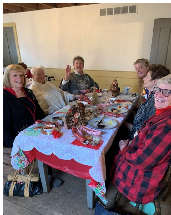
Enjoying the Christmas Tea.