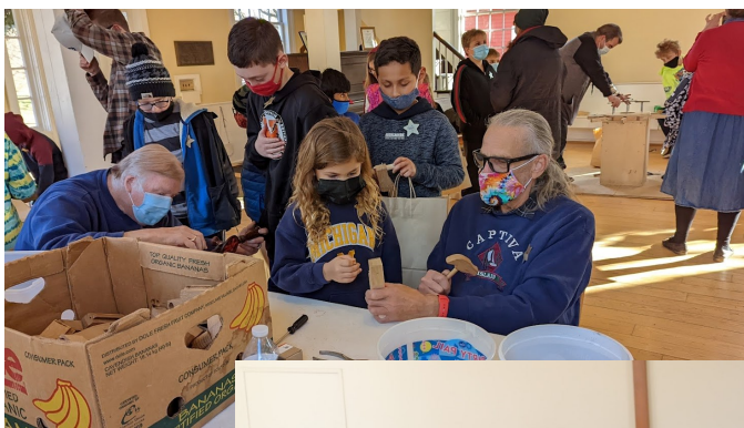
Kids and guides enjoying their time in the Church