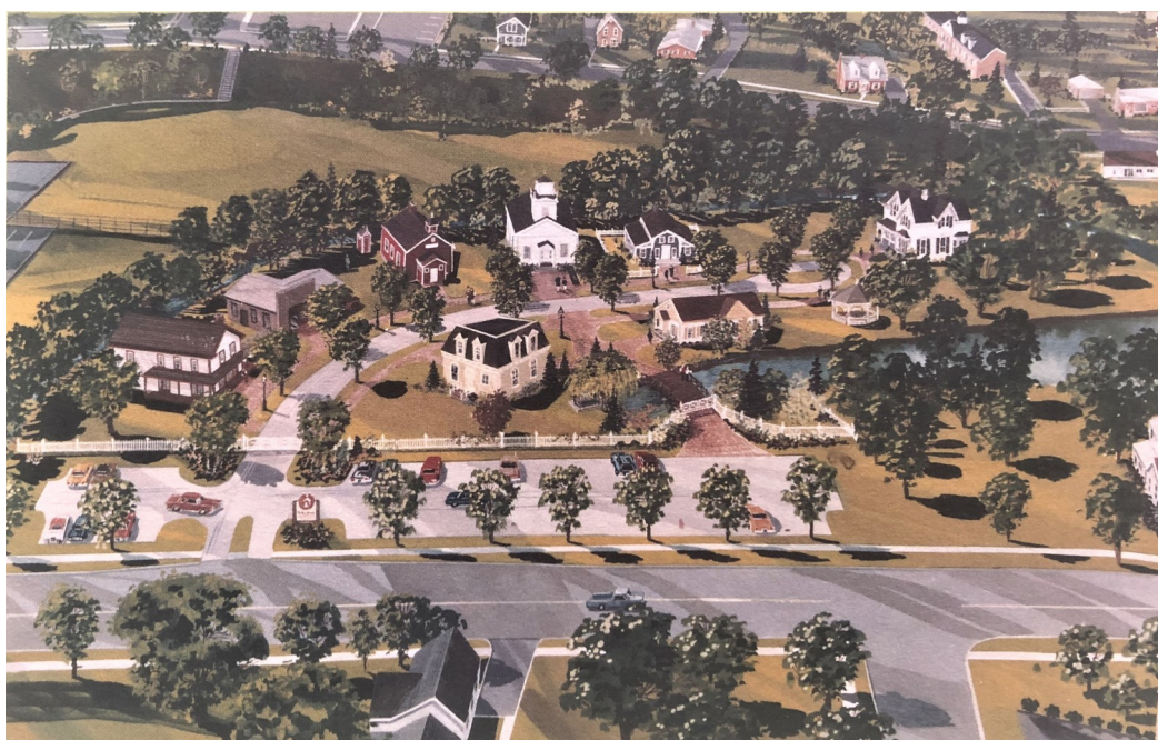
1972 rendering of the Mill Race Historical Village by Don Fee