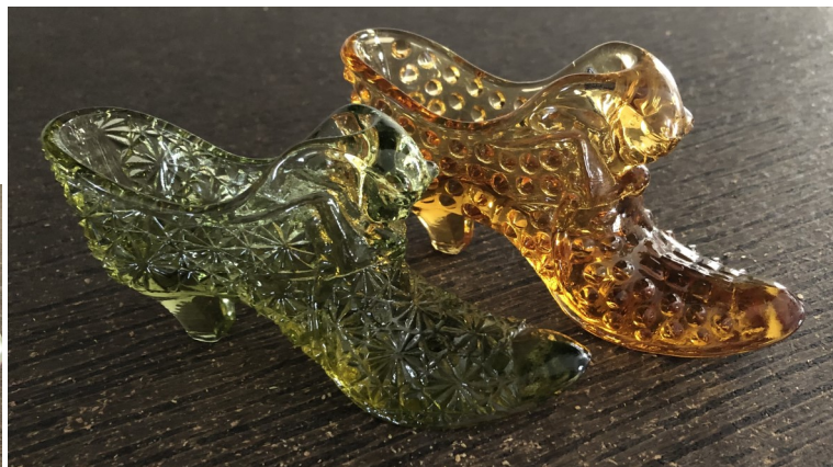
Selected items from the Artifact Sale