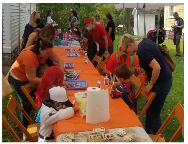
The Northville Art House Hosted the craft tent.