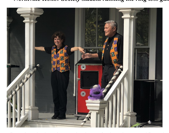
Crowds enjoying the magic show of Ming the Magnificent!