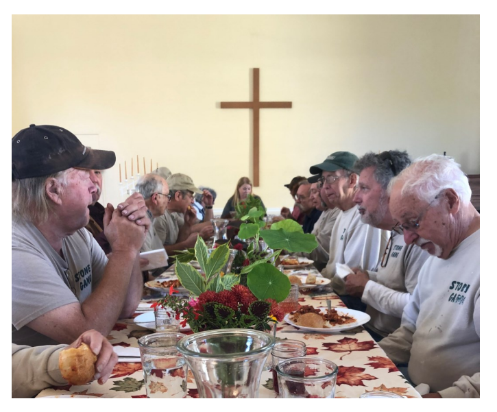
Volunteers enjoy a meal prepared by MRV staff at the annual Volunteer Recognition Luncheon.